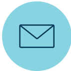
Bill Pay access