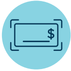
Remote deposit capture

Business checking accounts at Minnesota Lakes Bank offer other services including a large selection of checks, endorsement stamps, coin and currency exchange, night depository and access to the following electronic features: