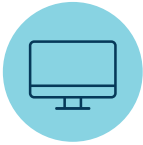
Online banking access